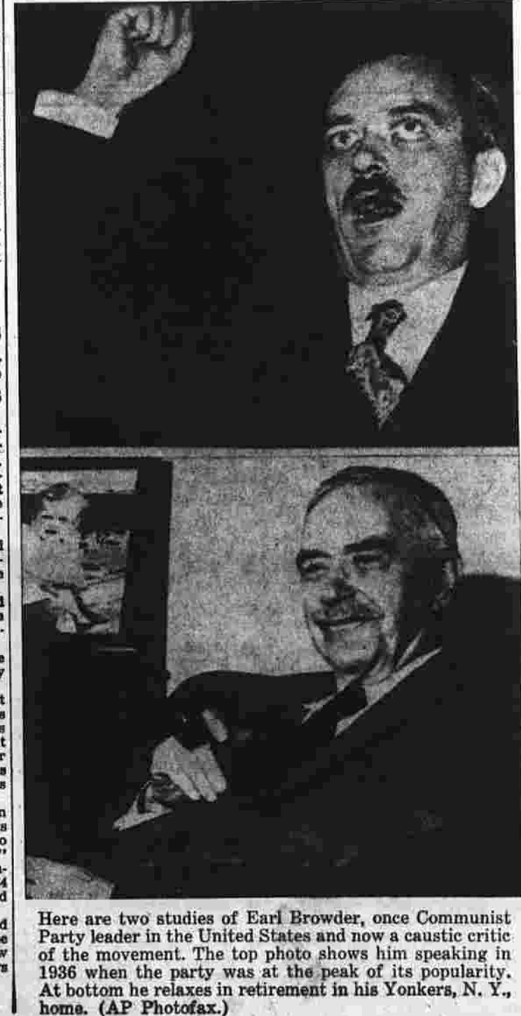
Here are two studies of Earl Browder, once Communist Party leader in the United States and now a caustic critic of the movement. The top photo shows him speaking in 1936 when the party was at the peak of its popularity. At bottom he relaxes in retirement in his Yonkers, N. Y., home.

YONKERS, N.Y. (AP)—Two FBI agents called on a gray-haired, grandiose man yesterday about 30 people in the apartment with a little man few persons would notice in casual passing.